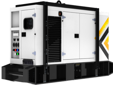
Illustrations may show optional equipment

TYPE: IP56, outdoor rated, weather-proof design ✓