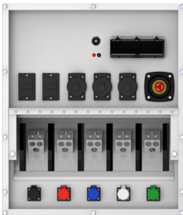
Illustrations may show optional equipment