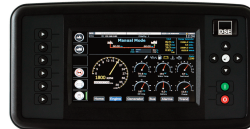
DSE8721 Colour Remote Display Module