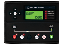
DSE871X Standard Remote Display Module