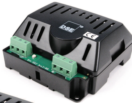
DSE9150 - 3 A 12 V