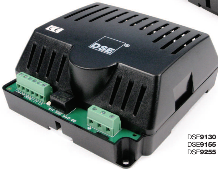
DSE9130 - 5 A 12 V DSE9155 - 2 A 30 V DSE9255 - 5 A 24 V