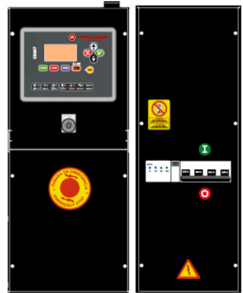
Pictures of Control Panel RH and Controller LH may include optional equipment and/or accessories

Also included in Hipower's supply: Emergency stop button and mainline circuit breaker.