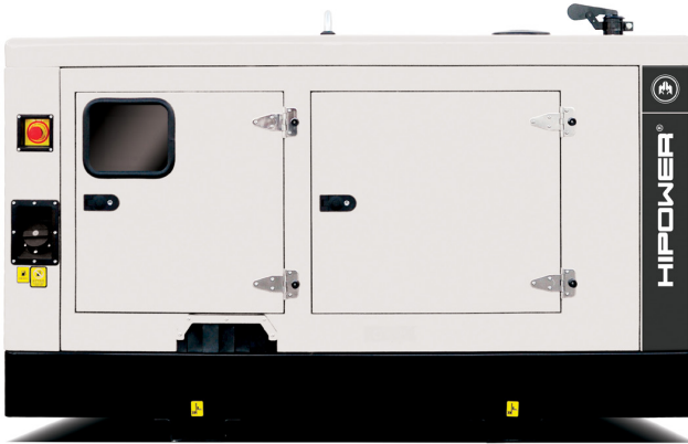
Generator depicted with sound attenuated option, some accessories for display only.